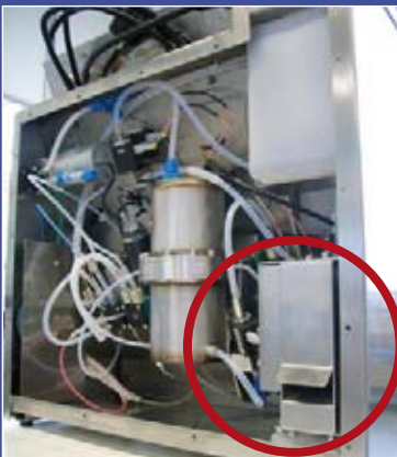
ECOSolv is completely integrated in the JET 2 SE