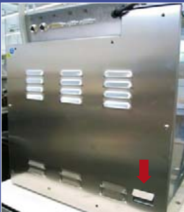
With the closed back you can only see the outlet of the air duct.